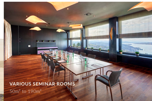
VARIOUS SEMINAR ROOMS 50m 2 to 190m 2